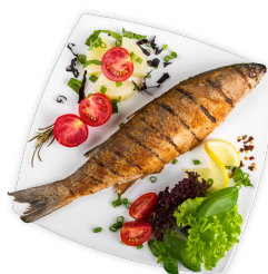
Fish - Seafood